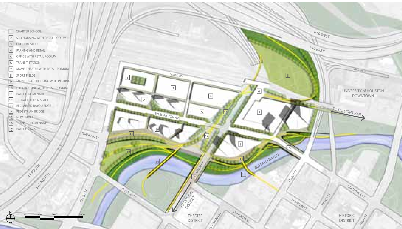
Heart of the Bayou master plan

Heart of the Bayou is a 16 acre mixed-use development designed to retain residents and workers in downtown Houston. The mixed-use development replaces the current Post Office facility with approximately 1,000 housing units, retail, offices, entertainment, and civic buildings. With an emphasis on natural systems, responsive architecture, and local and regional connections, the community will provide both day and nighttime activities for area residents, framed by the Buffalo Bayou's scenic urban beauty. I worked on the master plan, systems analysis, programming analysis, development massing, and the final layout. The concept was submitted for the 2012 ULI Urban Design Competition.