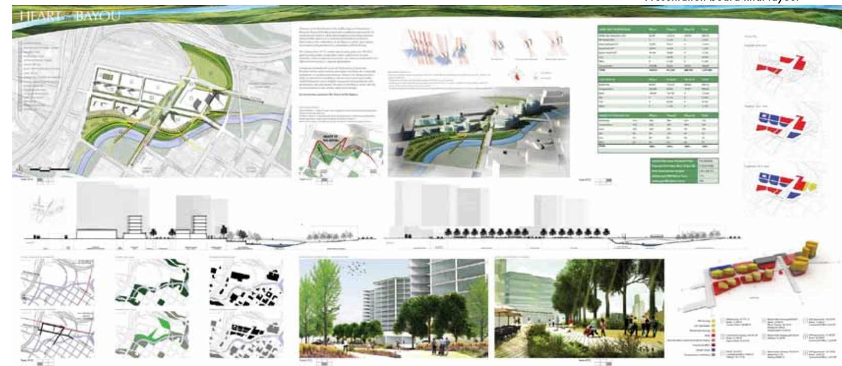
Presentation board final layout